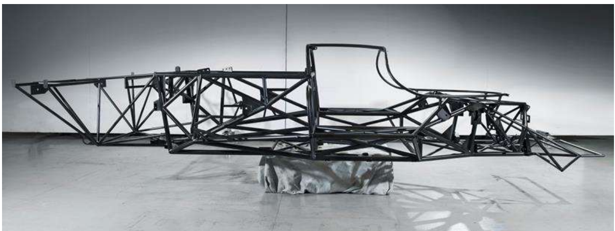
Body Shell Manufacture & Provisional Assembly to chassis.